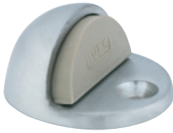
FS436 Meets ANSI/BHMA 156.16, L12141 for brass or bronze and L32141 for aluminum.