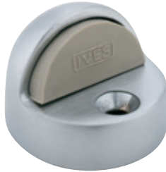
FS438 Meets ANSI/BHMA 156.16, L12141 for brass or bronze and L32141 for aluminum.