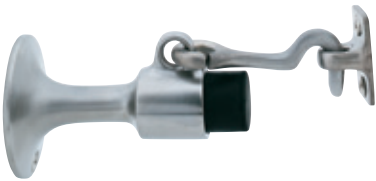
WS445 Meets ANSI/BHMA 156.16, L11351 for brass.