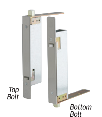
Meets ANSI A156.3 Type 25. UL Listed 90 Minute Fire Doors 8'0" x 8'0"